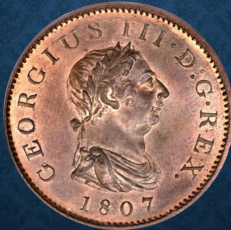
Half Penny