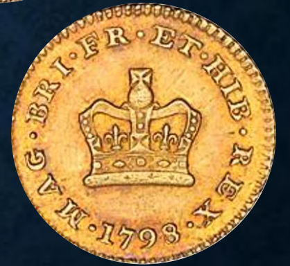
1798 Third guinea, first type, 17 mm, 2.8 gm