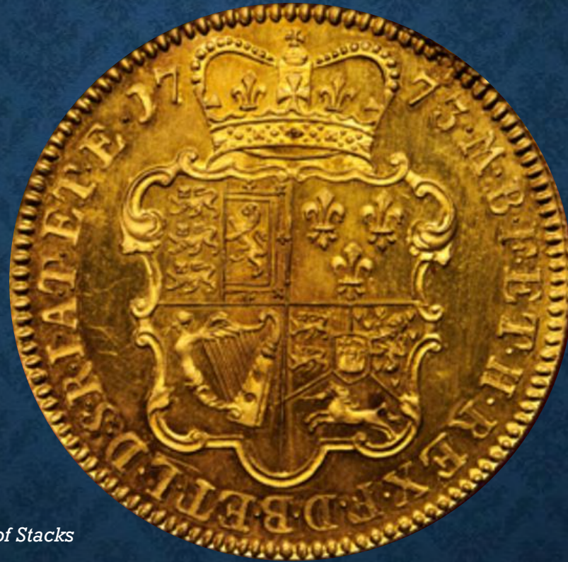
1773 pattern 5 guinea, 37 mm, 42 gm