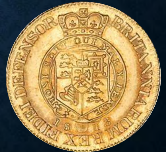
1813 (Military) guinea, sixth head