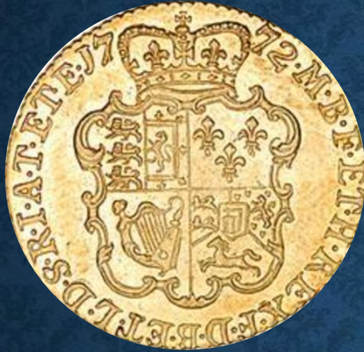
1772 guinea, third head