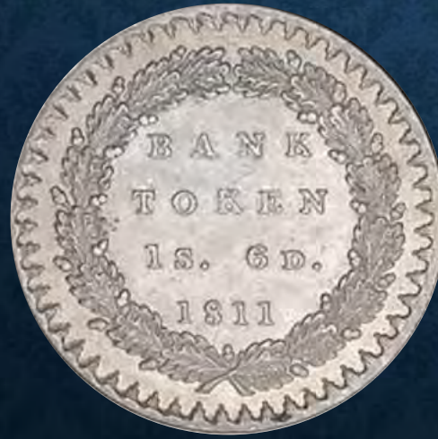
Eighteenpence (1 ½ Shillings), "First Bust" Earlier type (1811-1812)