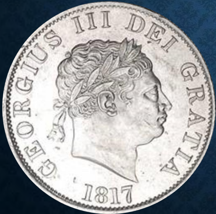
Half Crown