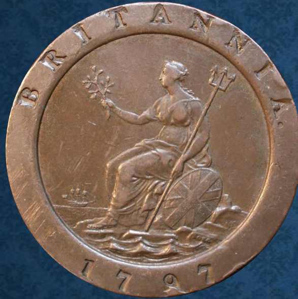
Laureate bust right, Seated Britannia left, raised rim