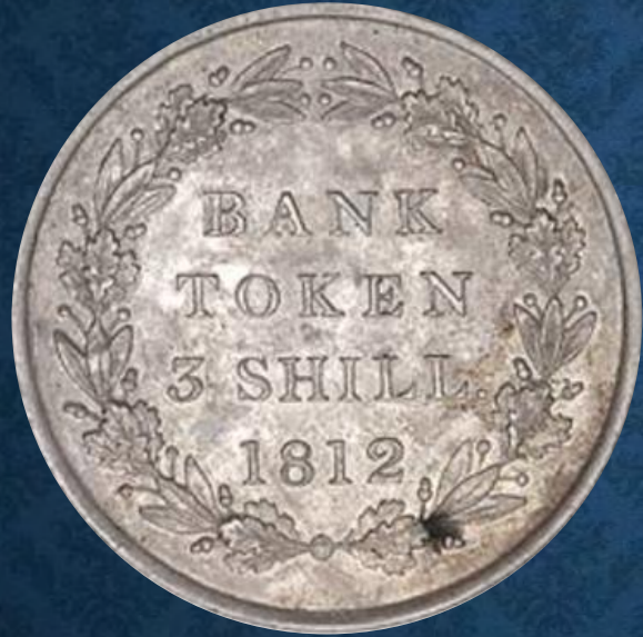
3 Shillings, "Second Head" Later type (1812-1816)