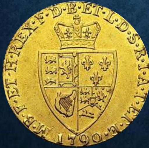
1790 (Spade) guinea, fifth head