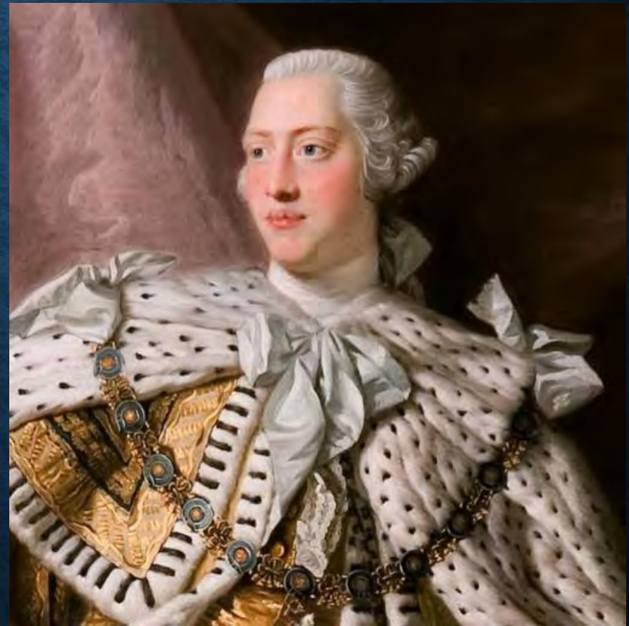
Coronation portrait by Allan Ramsay, 1762